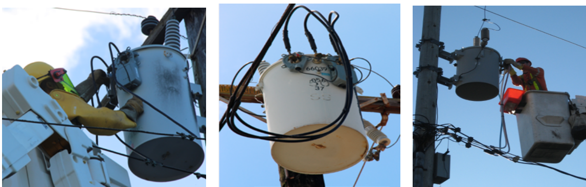
GRIDWIDE FIRE-NET sensors to be deployed on Distribution Transformers

Clearly, electricity operators require new technologies and funding support to ensure safe and reliable service; while also helping to protect their local communities and the surrounding environment. Asset-induced fires and wildfires validate this need annually.